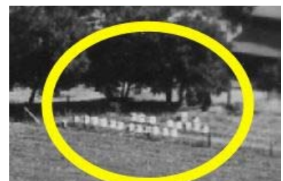
Thanks to digital zoom...we can see the Bee Hive Boxes in the photo on the left.

The family and future owners continued to have bees on the property pollinating their orchards until about 1970.